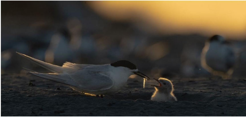
Waikanae Estuary