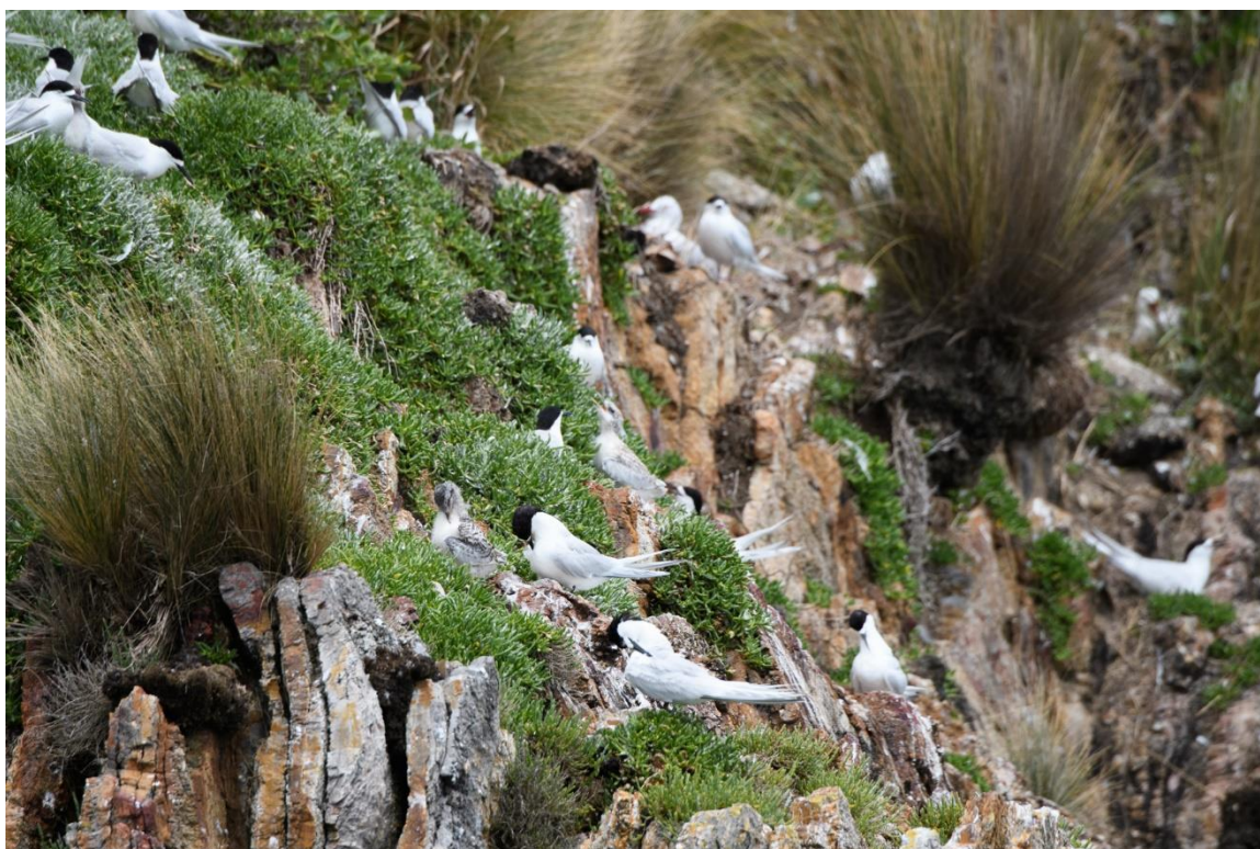
Tara / white-fronted terns and a tarāpunga / red-billed gull, Koi Island, Waiheke Group.